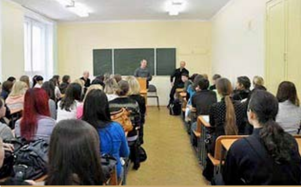
Speaking to students at the Mari State University.