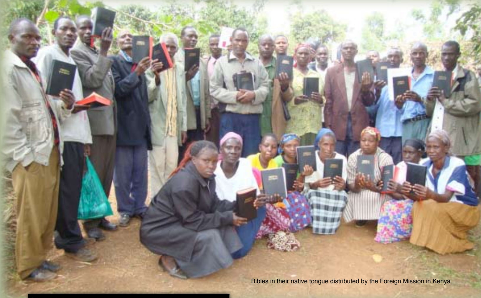
Bibles in their native tongue distributed by the Foreign Mission in Kenya.