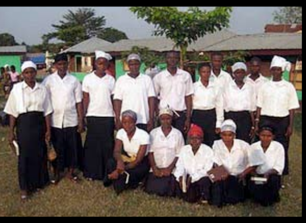
Prayer warriors who led the praise and worship prelude and assisted throughout the evening.

A gifted and devoted group of "prayer warriors" led the praise and worship prelude and assisted throughout the whole evening. Some of the men are