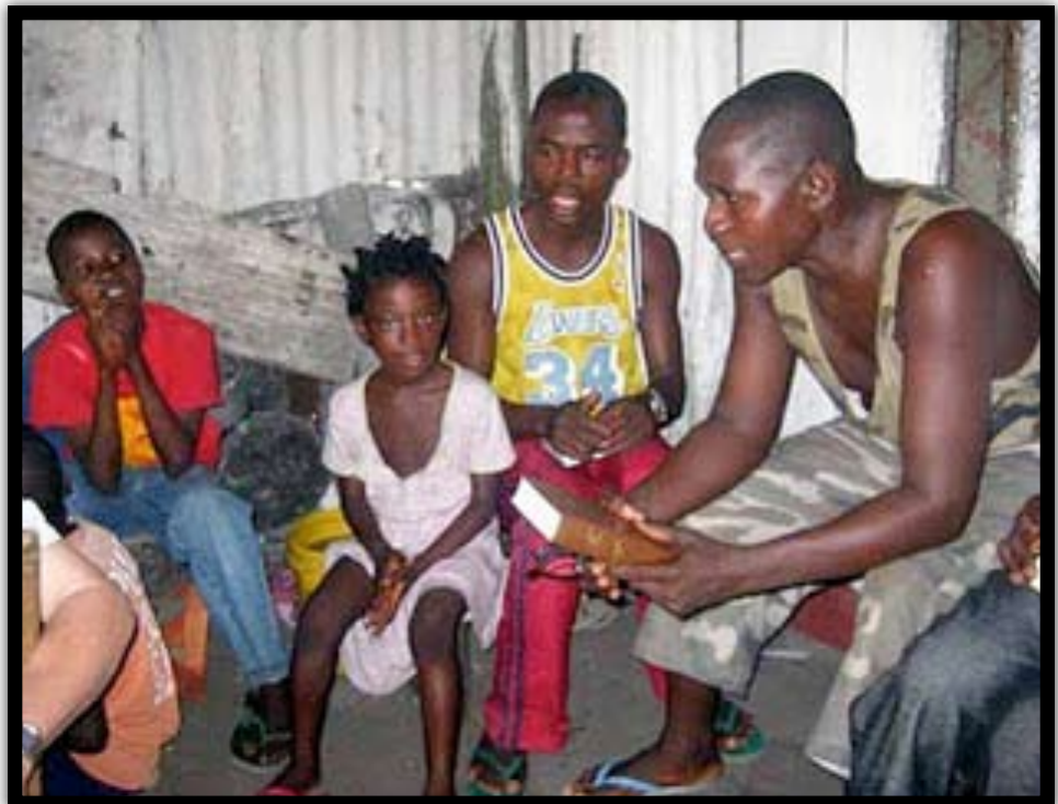
Family father in Zwedru with his cherished new Bible.

After the sermon on the Good Samaritan an invitation went out to anyone who "had been left by the wayside," who were burdened by sin, guilt, doubt or fear. At least 50 or 60 people,