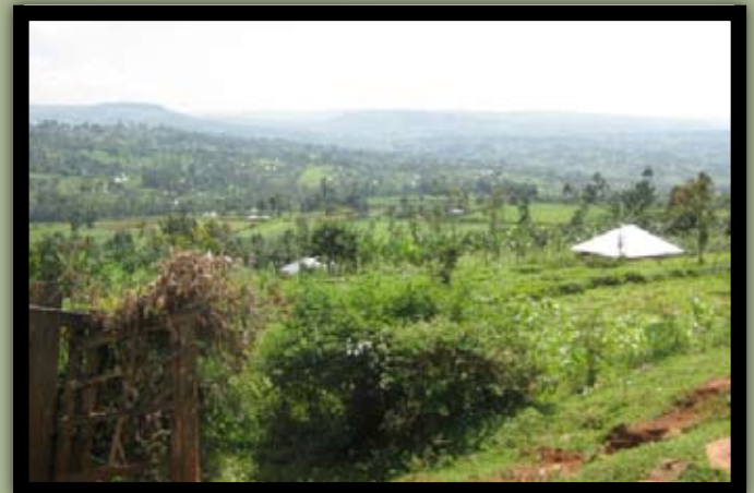
Lush and green countryside.