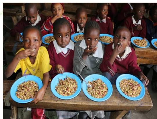
PHOTO STORY OF THE JALI MTOTO TRUST PROGRAM. VIDEO CLIPS ARE ALSO AVAILABLE