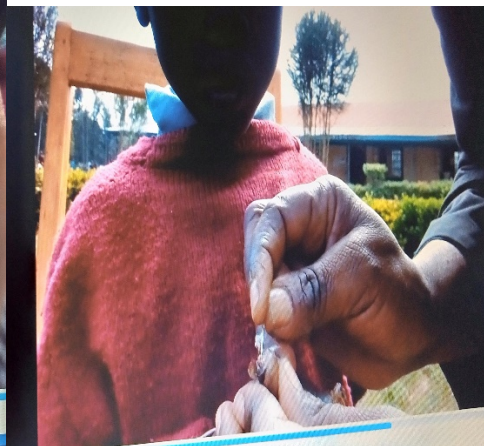
SELECTED PHOTOS OF JIGGER INFESTATION.